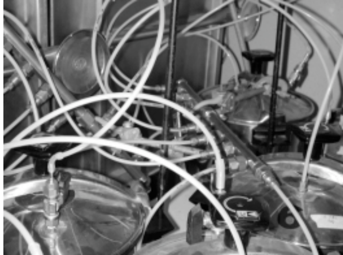
Figure 2. View of fumigation chambers from above

from Detia Degesch which were placed in the 1 m 3 chamber. This chamber provided the gas supply to avoid quick changes in case of leaks